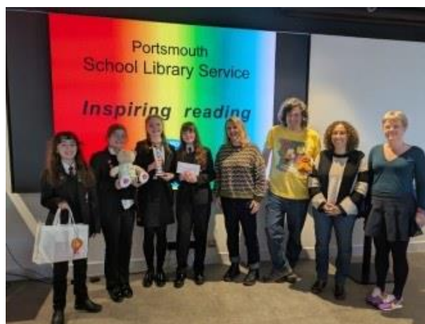
The team even met the authors, took part in Q&As and brought home a fantastic prize: new books for themselves and the school library. Well done Team Trafalgar!